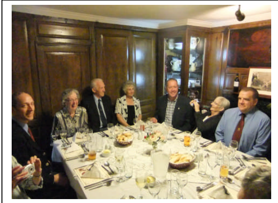
The dinner party