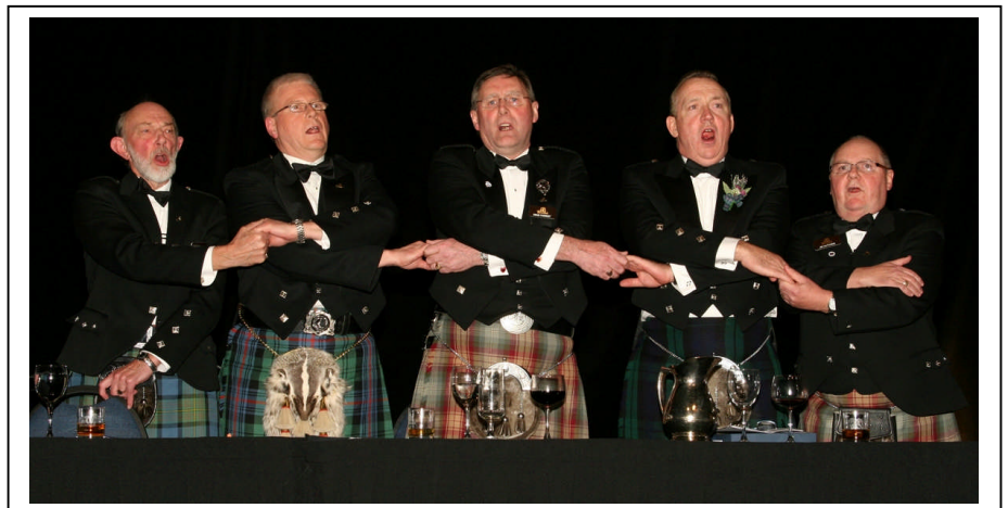
The head Table singing Auld Lang Syne