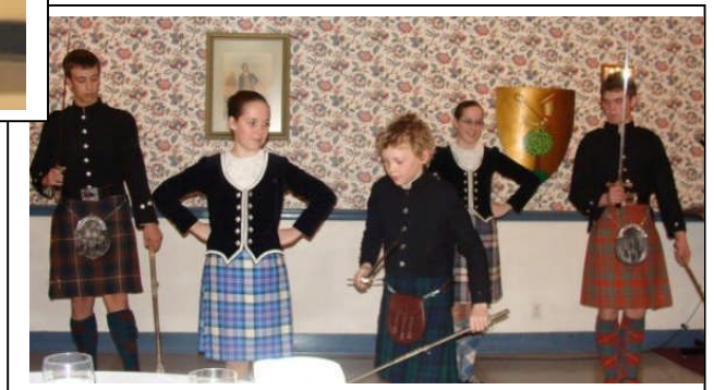
The Caledonian Dancers preparing to display